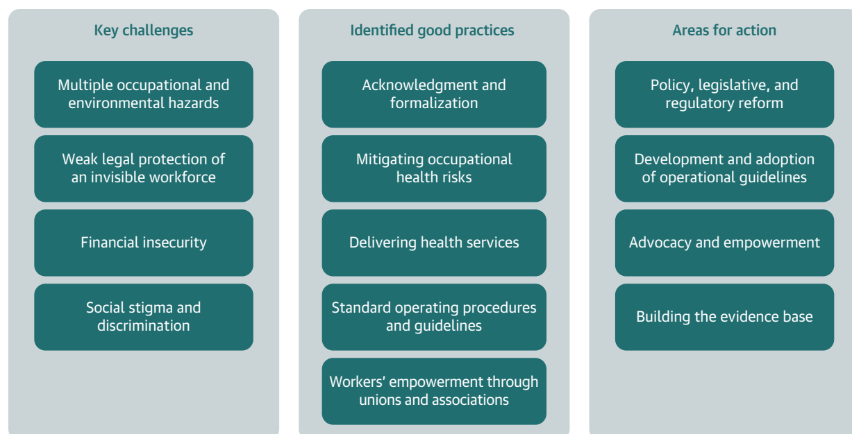
FIGURE ES.1. Key Challenges, Identified Good Practices, and Areas for Action

Sanitation workers range from permanent public or private employees with health benefits, pensions,